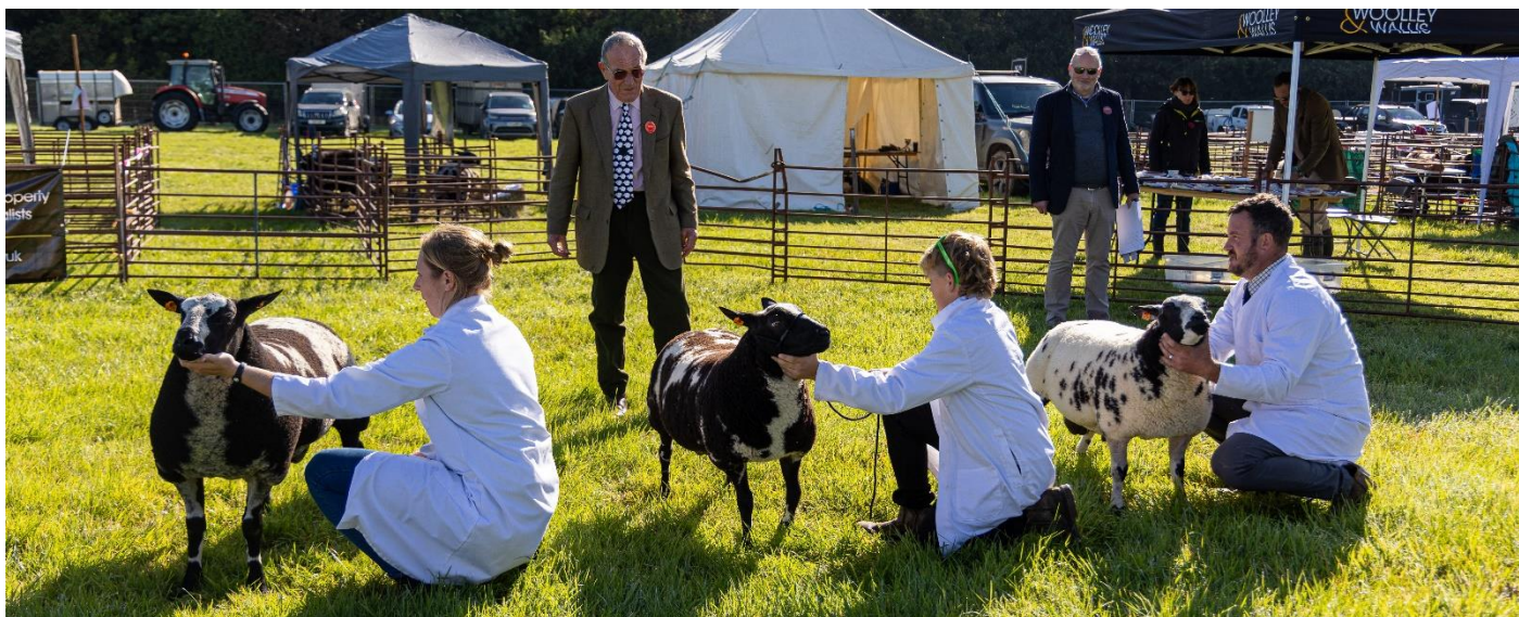
Photographs of the coaching and sheep class