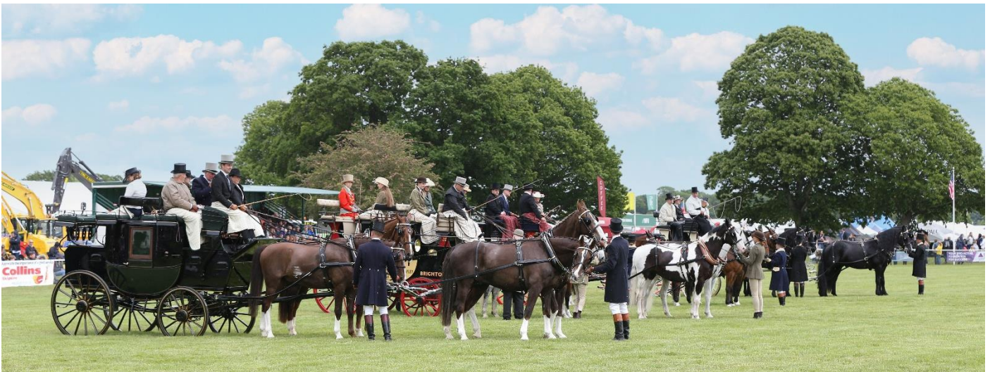
An example of a Coaching class.

Once back in the ring the competing teams will circle, line up and then be asked to give an individual demonstration, a last opportunity to maybe sway the judges decision with the action of your lovely horses or beautiful rein handling. Finally, with the convoy circling once more the class winner is chosen."